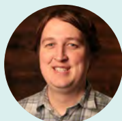
CLIFF DUREN CHURCH AT STATION HILL (SPRINGHILL, TN)