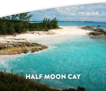
HALF MOON CAY

All dates & locations subject to change.